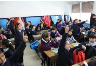
Hello from Ramallah (Palestine)